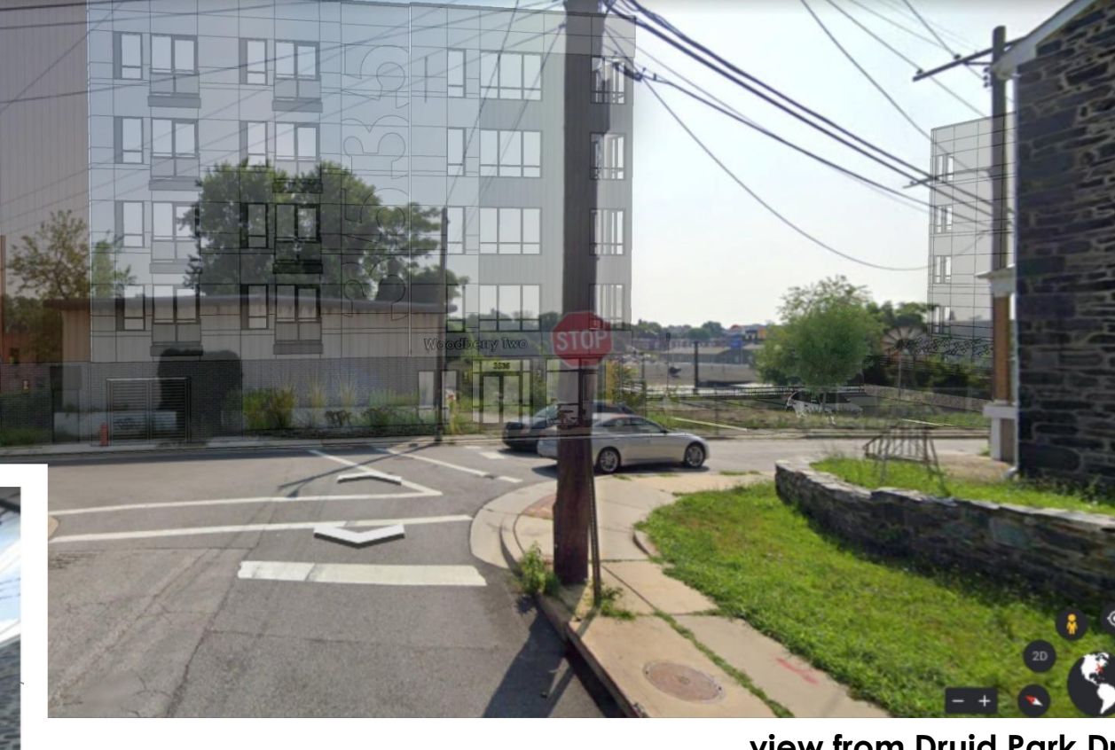
view from Druid Park Dr