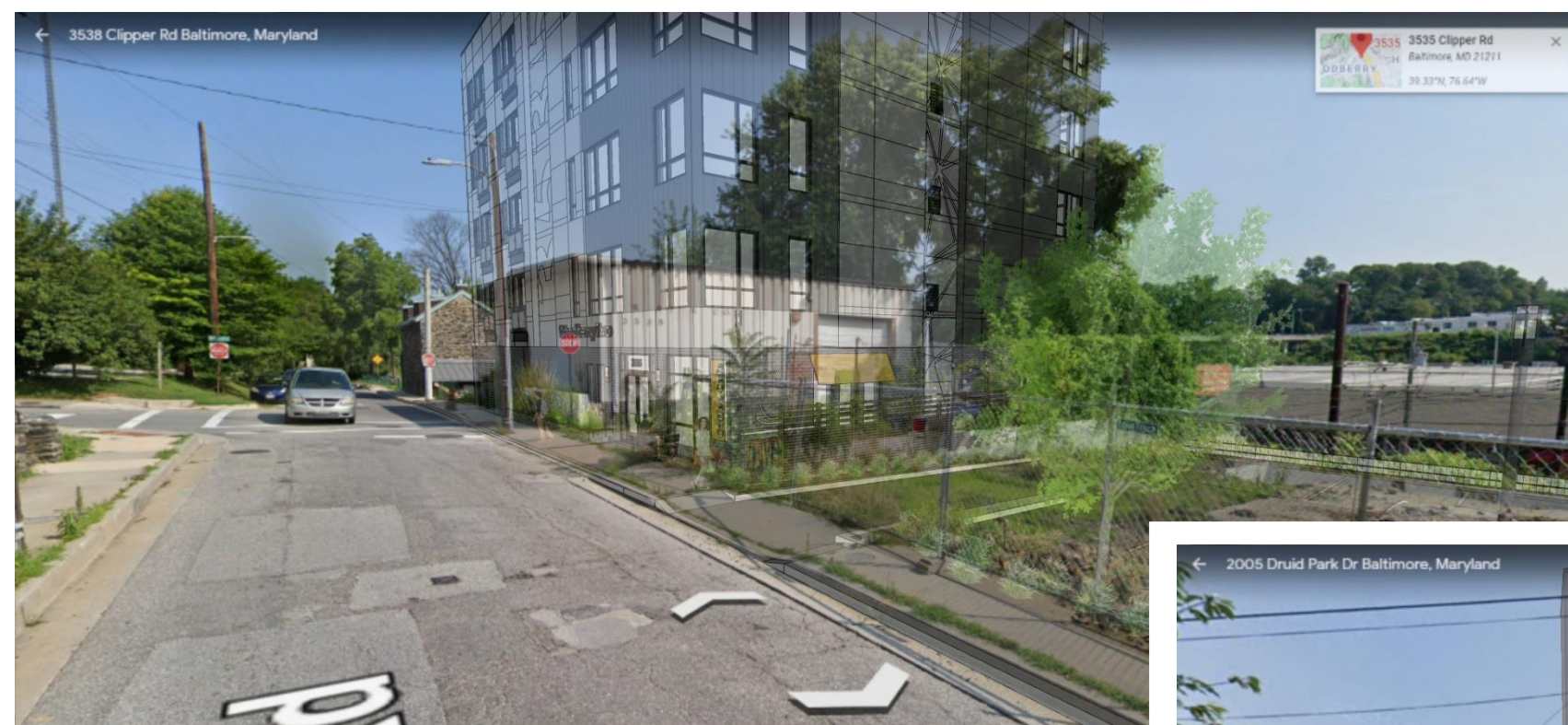
view from south on Clipper Rd